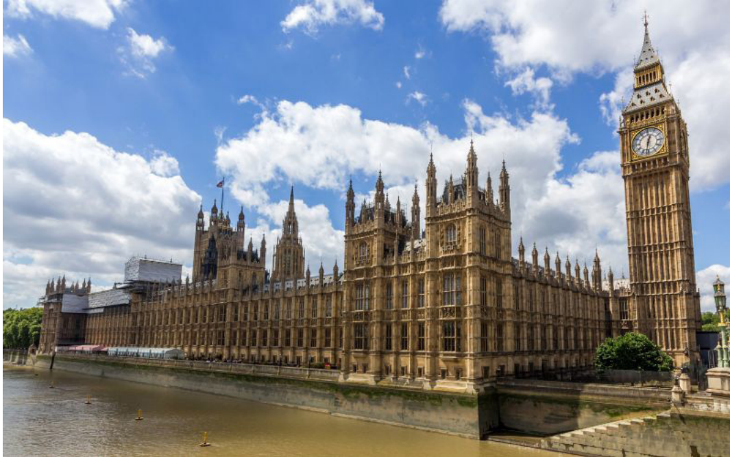
House of Commons and Palace of Westminster next to the Thames River in London, England.

Ed Neafsey Contributor @IrishCentral Jul 06, 2023